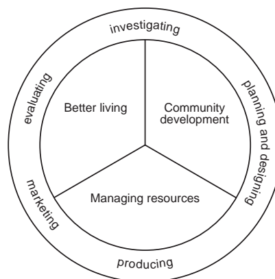
Making a living — processes

When investigating , students assess the nature and circumstances of problems or needs and determine the process or the product. The problems or the needs should be realistic and worth solving and also relevant to the needs of the students and their community. Students gather information to analyse the nature of problems and explore social, economic, technological, ecological or aesthetic factors that have a bearing on the kind of product or the use of particular techniques.