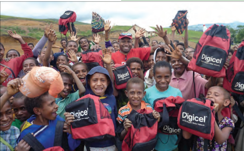
Excitement filled the air for these students of remote Western Highlands, when Digicel Foundation donated school bags, stationery items and books to them.