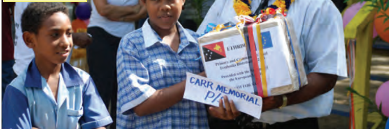
The Head girl and head boy of Carr Memorial Primary School receiving their European Union donated books, from Education Minister, James Marape, in 2010