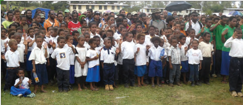
Elementary School children in Mt Hagen saying the National Pledge during the opening of the 171st NEB Meeting, in Mt Hagen Western Highlands Province.