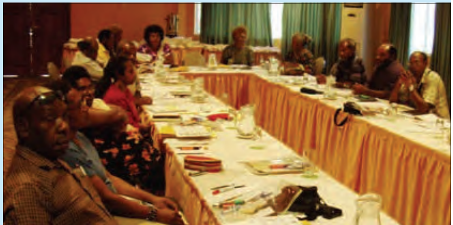
Provincial FODE officers attending a workshop before the signing of the MoU with the University of Goroka.

These are some of the changes that are happening to the FODE system so that FODE becomes not only an attractive and affordable system but a