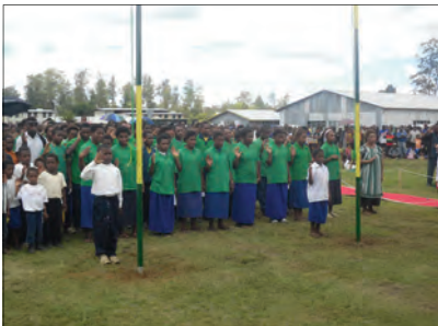
Primary school students saying the National Pledge in Mt Hagen, WHP